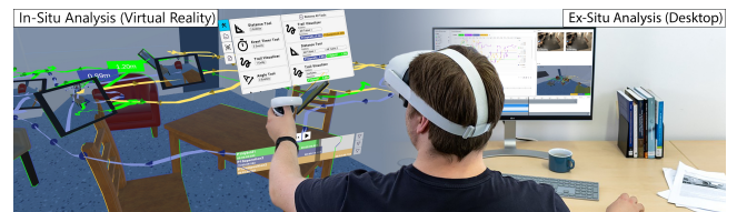
Figure 1: RELIVE combines a mixed reality environment for immersive analytics with a non-immersive desktop view for visual analytics.

Using RELIVE, researchers could thus make use of 2D surfaces and 3D spaces when analyzing an MR user study. For example, a researcher may start on a 2D surface to load in the data, create a computational notebook to aggregate and visualize the data, and identify outliers. Here, conventional devices such as keyboard and mouse offer ergonomic and precise input, allowing researchers to interact efficiently with dense data visualizations. For the investi-