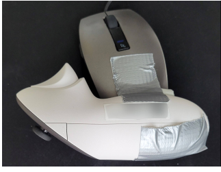
Figure 3: An initial prototype of the “hybrid mouse” could combine a desktop mouse with a Meta Quest 3 mixed reality controller, offering both indirect 2D pointing and spatial input.